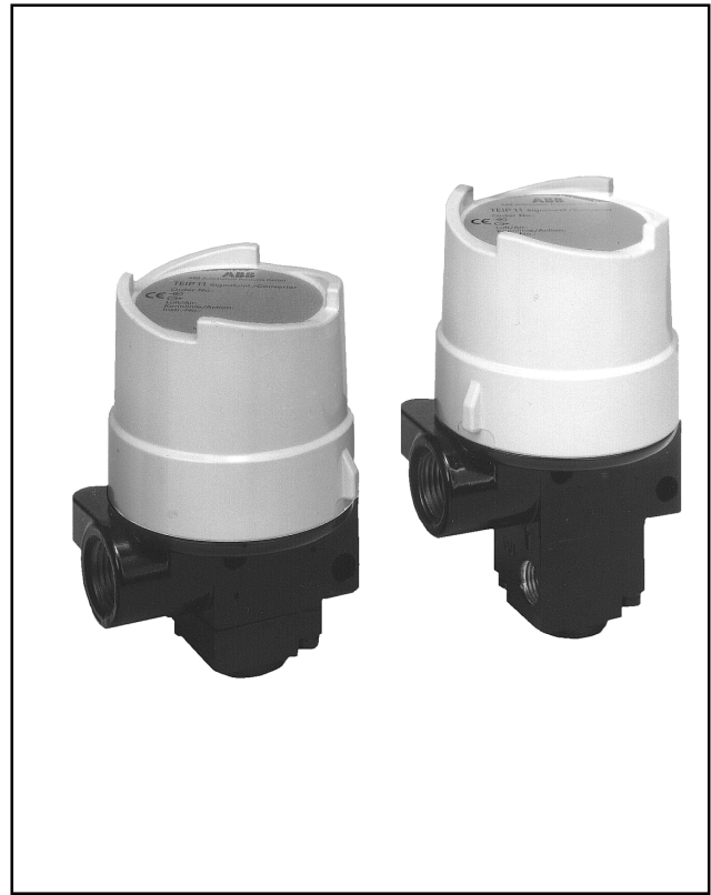
Series I/P Signal Converters for Standard Signals without Booster Stage